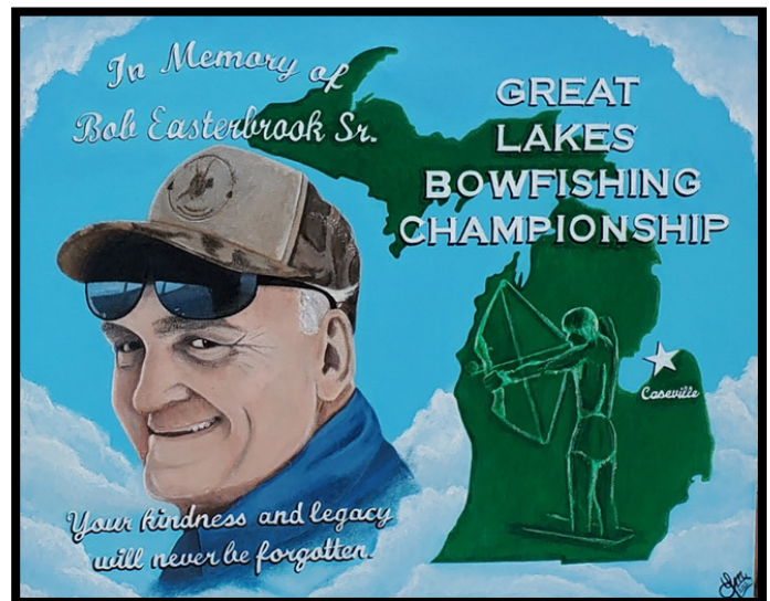
Original painting by Logan Marquis. Commissioned by Dan Horn

220 vehicles were strategically positioned and ready to jump into action the moment their team numbers were randomly drawn. Most were trucks with trailers sporting a wide variety of creative watercraft ranging from canoes to flat-bottomed john boats to large prop-driven airboats