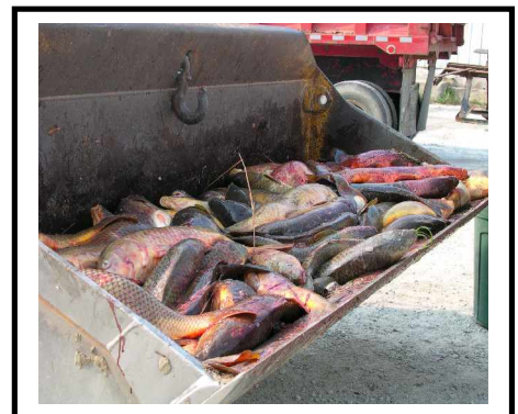
Nearly 40 tons of "trash fish" passed through the bucket of the front-end loader over the weekend. Removal of these non-indigenous fish is actually beneficial to the local sportfish populations and waterfowl habitat.