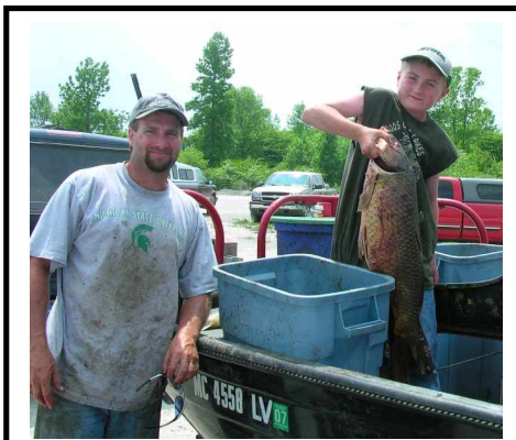
Kids of all ages enjoyed the weekend weather and on-again-off-again bowfishing action out on the water. Bowfishing is a great way to get kids actively involved in outdoor sports.