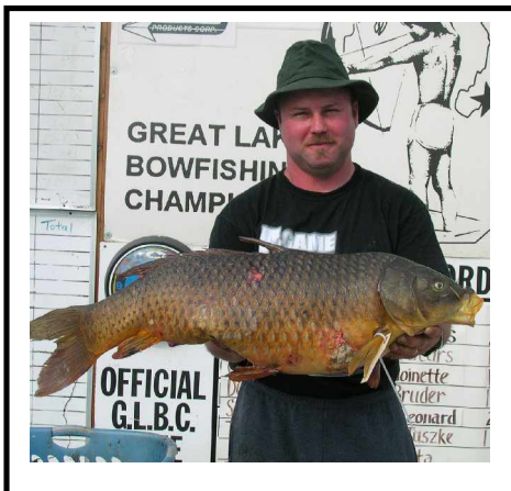
There were lots of big "hawgs" taken over the weekend. Though this one didn't quite quality as the big money fish, it's still a handful!